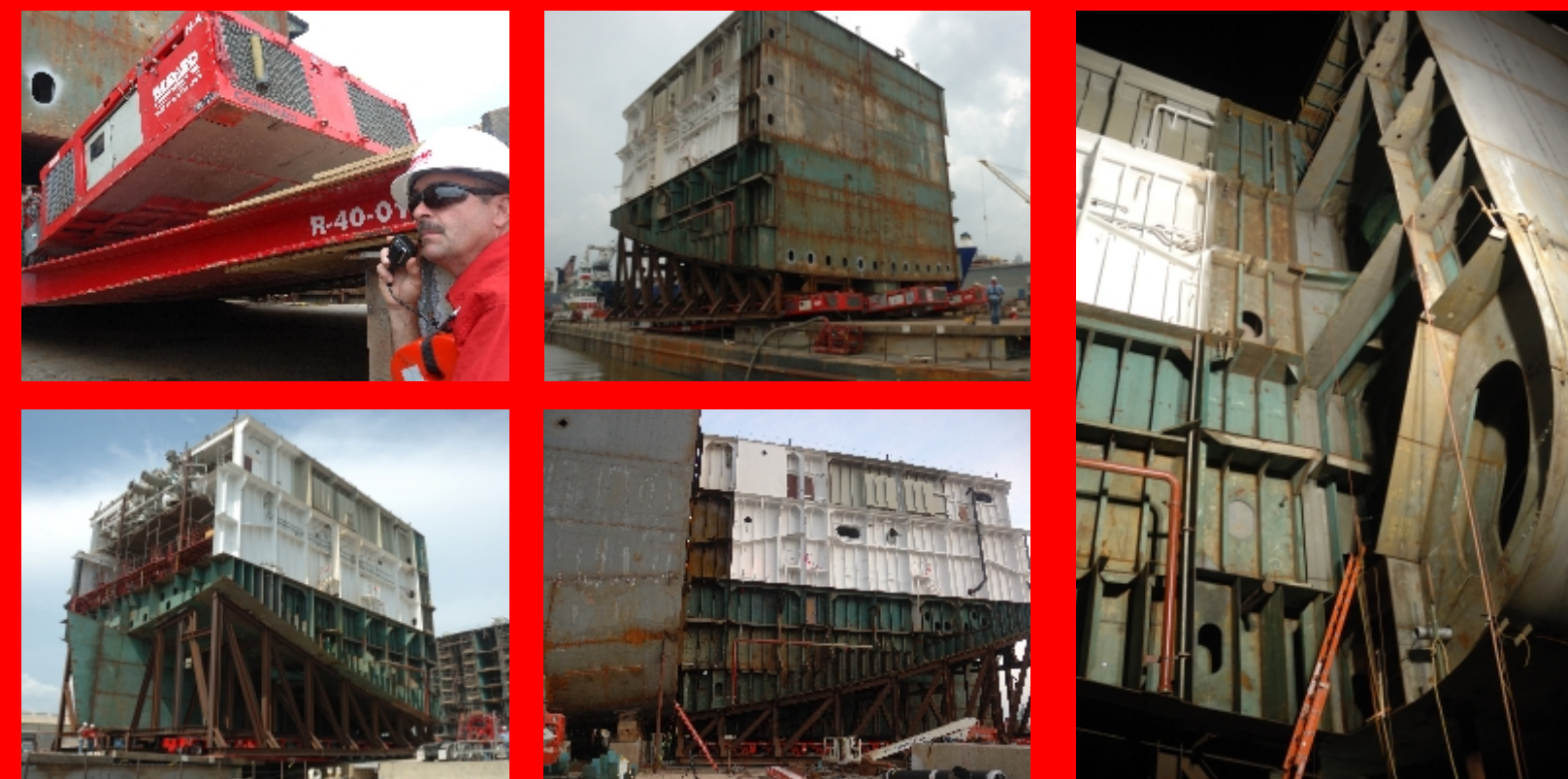
See more photos of this massive move! Click Here!

Moved in the same week as the liftboats in Alabama, this 1600 ton power module built in Harvey, LA., was loaded out onto a barge then transported to Mobile, AL to be joined with the rest of a waiting 600+ foot long tanker ship. The final positioning of the module to the ship was critical, and this is where the versatility of the spmt's and a skilled operator (Brady Judice) really shined through. Just another day at the shipyard for the Berard Team!