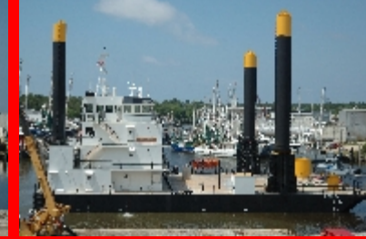
The liftboat lowered into the water for the first time!

See more photos of this move! Click Here!