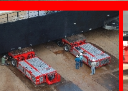
The load in position and ready to roll onto the barge.