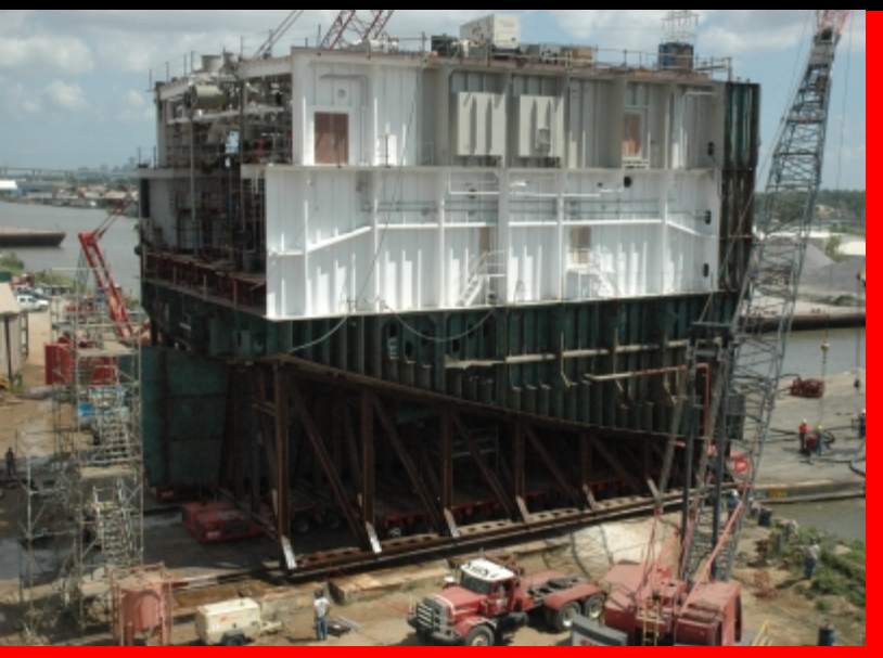
The 1600 ton power module loaded out in Harvey Louisiana.