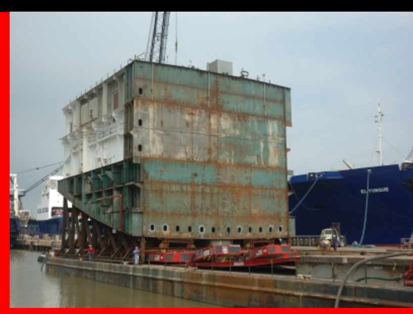
Now in Mobile Alabama, the module is ready to be offloaded.

Moved in the same week as the liftboats in Alabama, this 1600 ton power module built in Harvey, LA., was loaded out onto a barge then transported to Mobile, AL to be joined with the rest of a waiting 600+ foot long tanker ship. The final positioning of the module to the ship was critical, and this is where the versatility of the spmt's and a skilled operator (Brady Judice) really shined through. Just another day at the shipyard for the Berard Team!