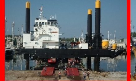
The liftboat lifting off.